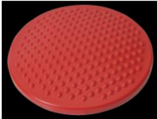
Disc O Sit