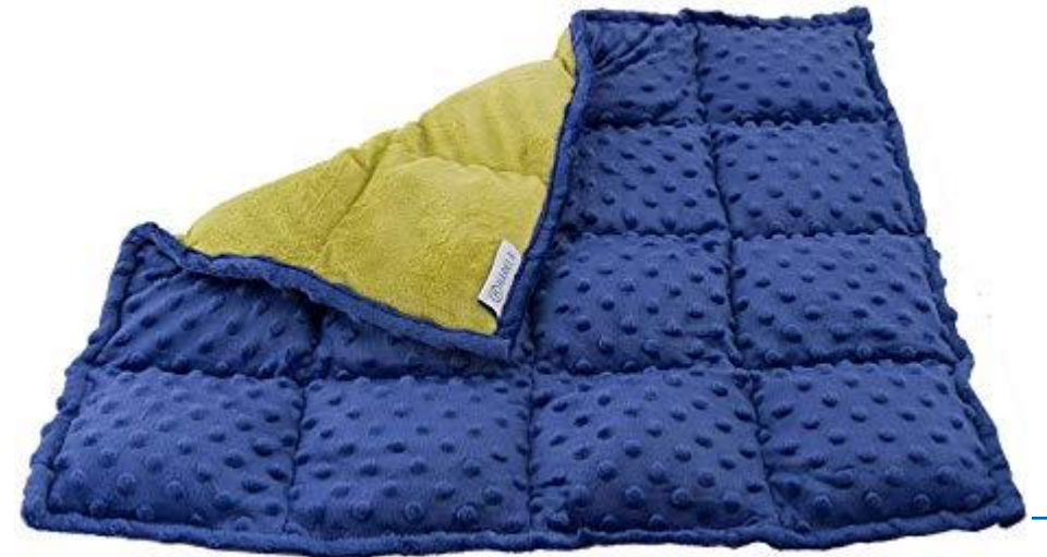
Weighted Lap Pad